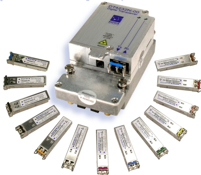
DT4232N with an array of available SFP options (for transmission at 1310nm, 1550nm, or CWDM wavelength)

Aurora Networks' DT4232N Digital Transceiver is a component of Aurora's Integrated Digital Transport System that digitizes two discrete legacy 5–65 MHz RF return path signals from separate inputs. The module's optical transmit/receive ports are implemented with optional plug-in transceivers for ultimate flexibility and affordability. Conforming to the Small Form Factor Pluggable (SFP) Multisource Agreement, these state-of-the-art transceivers are available in a variety of transmit/receive wavelengths, including dedicated 1310nm (for 10 and 40 km links), 1550nm (for links up to 40 km), and CWDM ITU grid (for links up to 40 km), all operating at data rates of 3.2 Gbps.