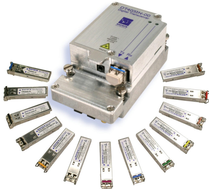
DT4032N with an array of some available SFP options (for transmission at 1310nm, 1550nm, or CWDM wavelength)

Aurora Networks' DT4032N Digital Transceiver is a component of Aurora's Integrated Digital Transport System that combines two major functions into one compact package: digitization of legacy 5–65 MHz RF return path signals and an Ethernet Access Device. The DT4032N transceiver digitizes the legacy RF return path and multiplexes native Ethernet traffic from the optical receiver port of a plug-in (SFP) transceiver module into the return transport system. By providing virtual pipes for Fast Ethernet services and legacy RF return on a single fiber, the DT4032N Digital Transceiver alleviates fiber exhaustion, greatly simplifies the network and provides distinct time-to-market advantages in turning up new revenue bearing services, including voice, video and data services.