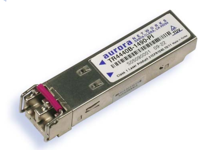
Pictured above: SFP module for 1 of 15 available CWDM wavelengths

TR4440B series CWDM Optical Transceiver Modules enable additional capabilities for high-speed communications required for Aurora Networks' digital networking products. These modules are functionally identical to the transceivers already built into many of Aurora Networks' products (e.g., DT4000 and DT5000 series optical node transceivers), but provide a flexible, plug-in means of enabling additional optional secondary ports in several of those products.