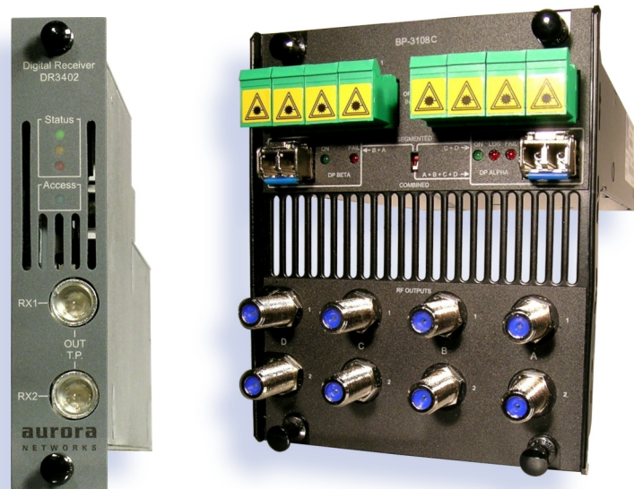
DR3402 Dual Digital Receiver