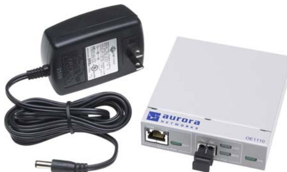
AC Adapter is included with ordered module.