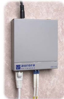
Desktop- or wall-mounted