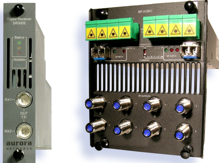
DR3002 Dual Digital Receiver